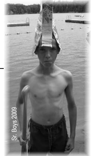
Sr. Boys 2009