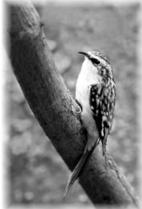
The Brown Creeper

Now that I, your Lord and Teacher, have washed your feet, you also should wash one another's feet. I have set you an example that you should do as I have done for you. John 13:14,15