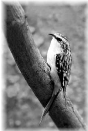
The Brown Creeper

Now that I, your Lord and Teacher, have washed your feet, you also should wash one another's feet. I have set you an example that you should do as I have done for you. John 13:14,15